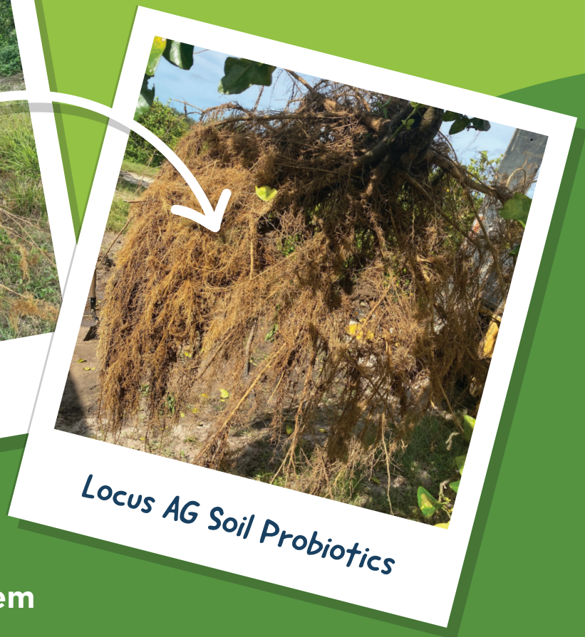
Locus AG Soil Probiotics